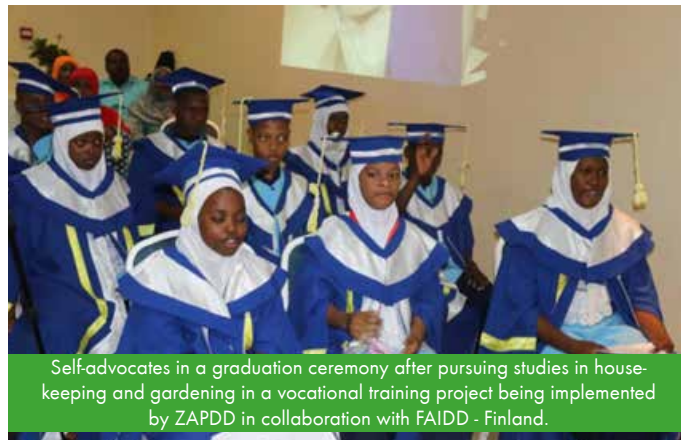
Self-advocates in a graduation ceremony after pursuing studies in house-keeping and gardening in a vocational training project being implemented by ZAPDD in collaboration with FAIDD - Finland.

+ Availability of resources (physical and fiscal) is paramount for achieving advocacy objectives.