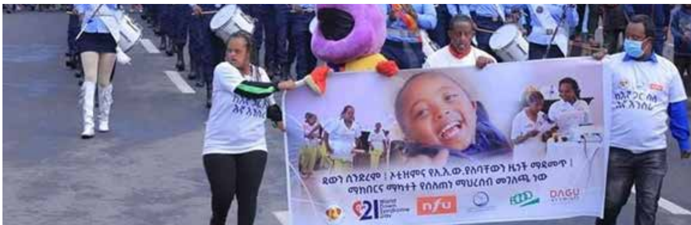
World Downsyndrom Day 2022