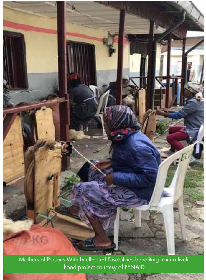
Mothers of Persons With Intellectual Disabilities benefiting from a livelihood project

FENAID has learnt that advocacy interventions on the rights of persons with intellectual disabilities and their families will be hinged on sustained awareness creation. In addition, building a strong FENAID brand will give the organisation access to spaces where it can influence decision makers and shape policy. That is why communication is such a strong pillar for the organisation.