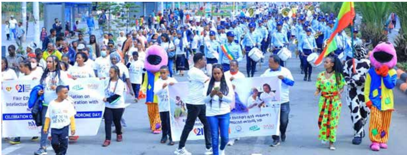
World Downsyndrom Day 2022