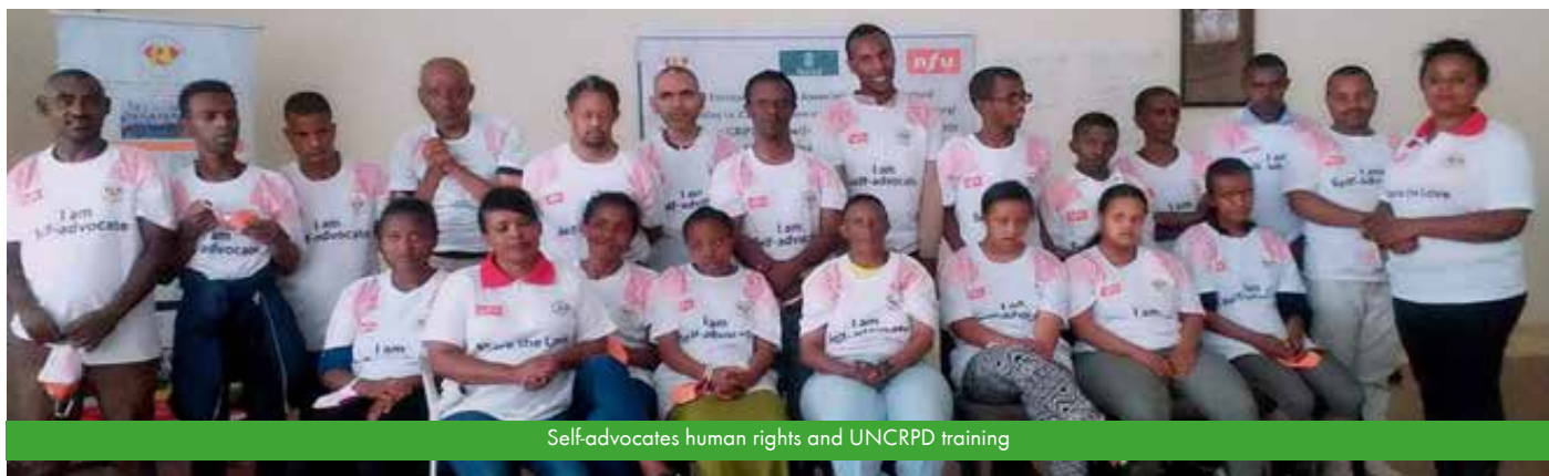
Self-advocates human rights and UNCRPD training