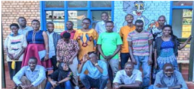
"Empower me to empower others"! Self-Advocates during a Self-Advocacy training.

The self-advocates and parents are empowered on CRPD, CRC and self-advocacy and are involved directly in advocacy drives.